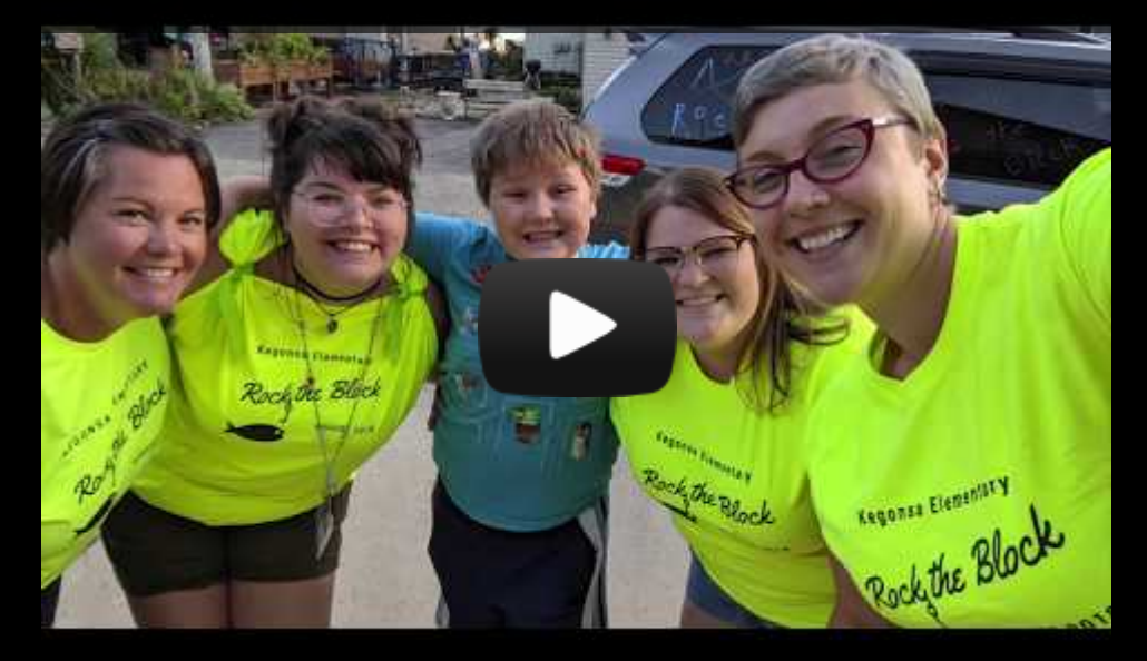
Rock the Block 2019