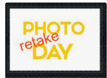
Photo re-takes will occur on October 7th.