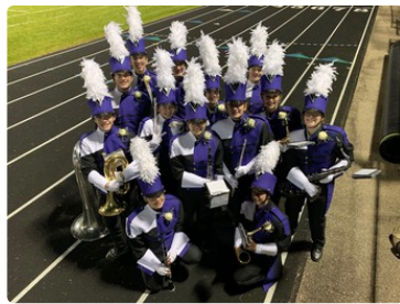
SHS Marching Band Members