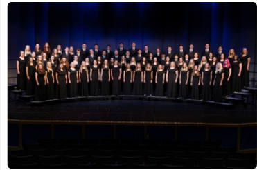
SHS Concert Choir